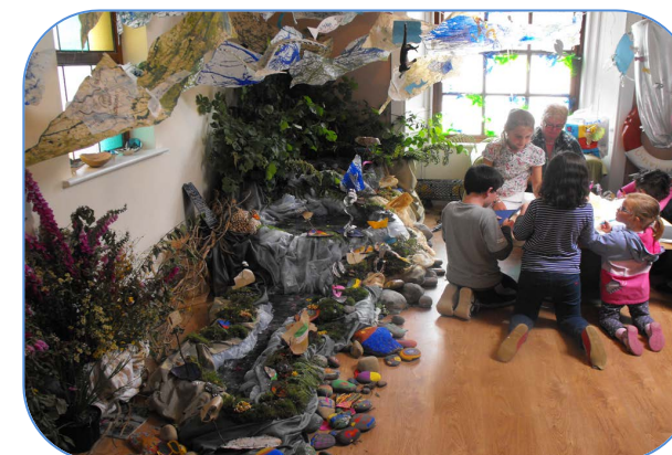
corridor; and by means of a river timeline - all of which

The café model was surprisingly successful in helping to re-establish a stronger river culture and the creation of a renewed platform for people and groups who are friends of the river to continue to share their passion and vision and work together to devise projects and ways of utilising the river and realising its full potential as a major amenity and source of life and inspiration for all.